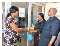
Official opening of Library Page 9