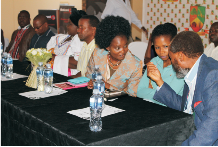
Mayor and Delegation at the Summit