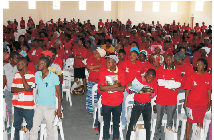
Youth attending the Summit

The Fetakgomo Local Municipality in conjunction with the Bokoni Platinum Mine held the 3 rd Annual Youth Development Summit at Sefateng Community Hall on the 21 st November 2014, themed “together moving youth development forward”. The aim of the summit was to address various issues affecting youth in Fetakgomo Local Municipality also to expose out of school learners, unemployed graduates and those willing to venture into business. Young people were given opportunities to apply their minds with the available opportunities presented to them by various sector departments and private sector.