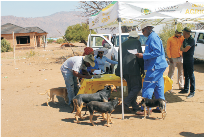
Dog being traeted and tested during the batho pele day

The 'PEOPLE FIRST PHILOSOPHY' has once again been brought to life with a celebration of the Batho Pele day which was on the 11th of September 2014 at Fetakgomo's Ga-Selepe. Government Staff and the citizenry were not only made to share information on all eleven Principles of Batho Pele, bringing back the spirit of 'putting people first', but were spot on in providing and receiving public services.