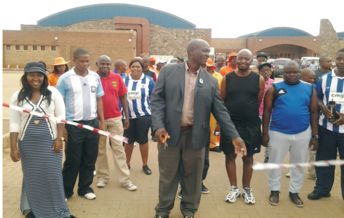
Employee wellness day