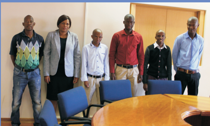
Newly appointed experiential learners

The Fetakgomo Local Municipality has officially appointed the first group of unemployed graduates for experiential learning programme in an effort to ensure improved delivery of services to the community. The programme is aimed at enhancing youth employability within the municipal jurisdiction