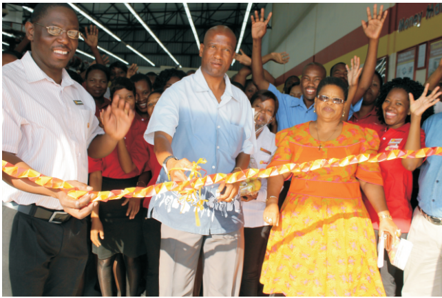
Opening of Usave