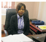
New appointment of Director for Development Planning. Page 3