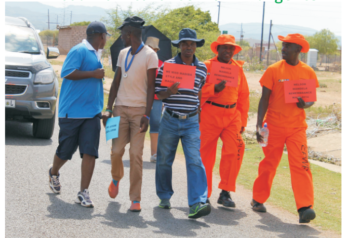
Nelson Mandela Remembrance Walk