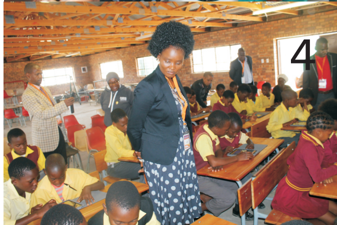
1.Fetakgomo Mayor test driving the tractor 2.One of the sanitation toilets handed over to the community 3.Mayor hold the declaration 4. Mayor looks on as students learn to use IPADS