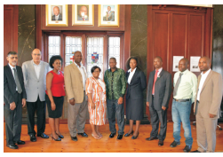
Mayor's trust offers lessons. Page 4